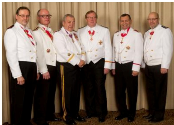
Knights of the Order – Finland & ScanBaltic Division

The division in Finland and the ScanBaltic area was established less than 10 years ago and has grown from a small group of twenty Knights and Ladies to many times larger. The division acts and keeps in contact with members according to its operational and informational plan. This plan was recently edited and released in brochure format. Squires and Ladies-in-Waiting are also active within the division.