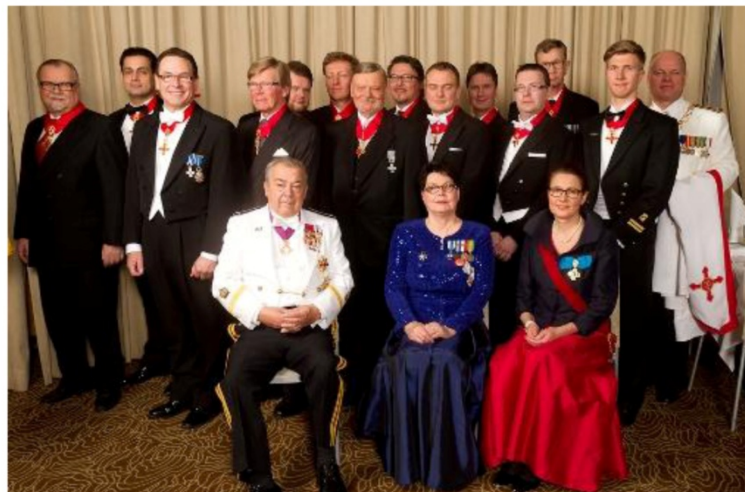
New knights and ladies in Helsinki.

Another highlight of the evening's celebration is to grant scholarships to students. In the past few years, young leaders, who have shown honor, established ethical morals and actively engaged in service, have been chosen. This year scholarships were granted to five exceptional young leaders.