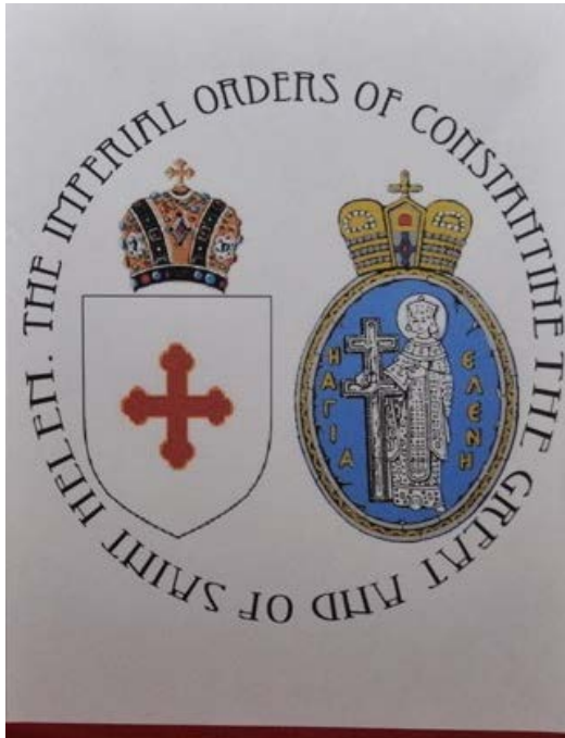
The Imperial Order of Constantine the Great and of Saint Helen