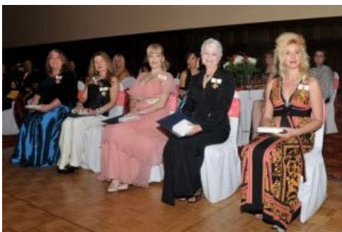
The Investiture Ceremony

"I study Quantum Physics , Neuroscience , and Consciousness . I believe that the key to the future is really a new way of thinking. There is no failure in life despite what popular culture believes! I believe in parallel universes and the Double Slit Experiment . Everything is really only happening because of the Observer . And the Observer is you and I. There is no experience without me, or you, the Observer, but more importantly, I can absolutely influence any situation the way I view it. Of course people confuse this with the Newtonian physics where everything has ALREADY been created. You cannot change that! But, you can change everything that has NOT yet been manifested. It is really all up to you. This is the good news! And this is the bad news! Because you cannot blame others from here on! I admire the work of Dr. Joe Dispenza , Dr. Stephen Hawking , Leonard Susskind of Stanford University and many other real great teachers, who are willing to go down the rabbit hole and are inventive enough to talk about their own experience as opposed to what they have learned."