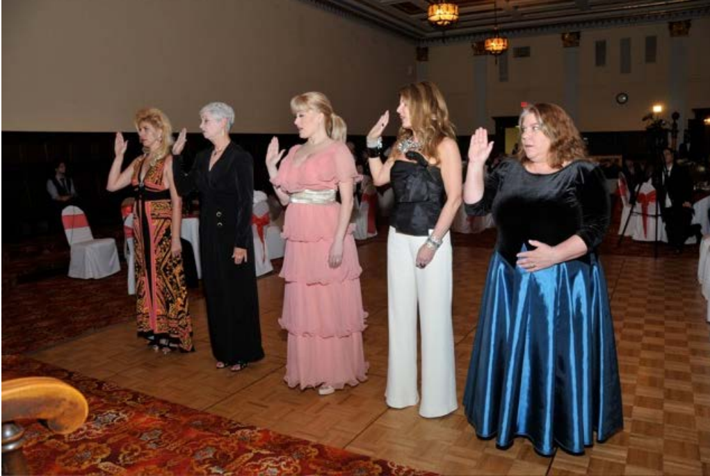
Investiture and Oath into the Chivalric Order

accident due to the fault of another driver in LA in March of 1998 after postproduction on the film was coming to an end, Papp suffered serious injuries and had a very challenging two years during the recovery period due to complications resulting from whiplash.